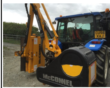
McConnel PA 470 POA