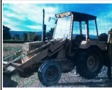
Ford 550 Digger £2,450