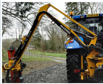
McConnel PA 55E £7,750