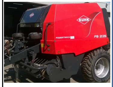
Kuhn 2135 low bale count